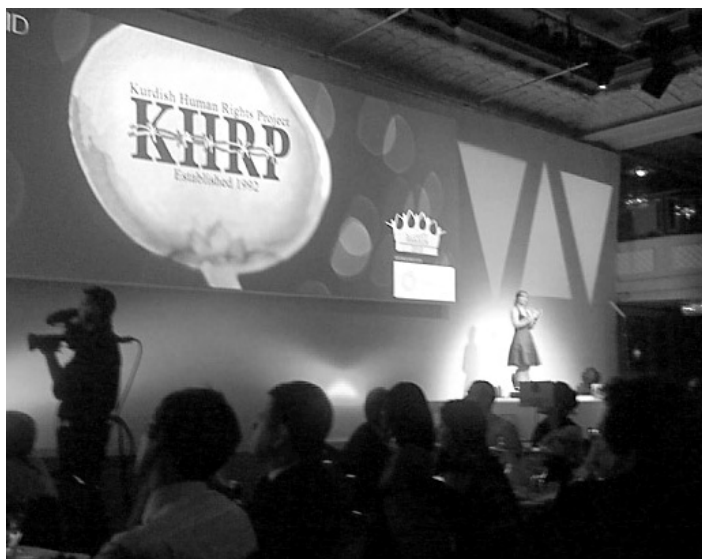
KHRP one of three organisations shortlisted under International Aid and Development.