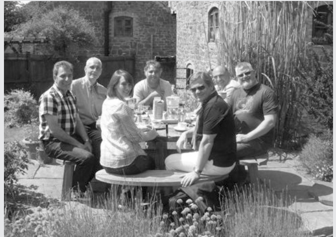
KHRP board strategy meeting, Malvern, June.