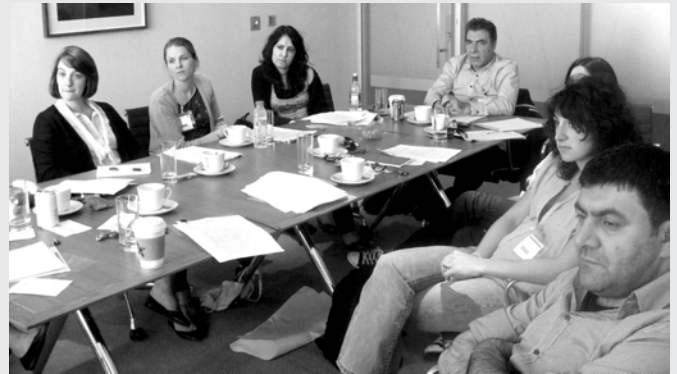
KHRP at staff strategy meeting in May.