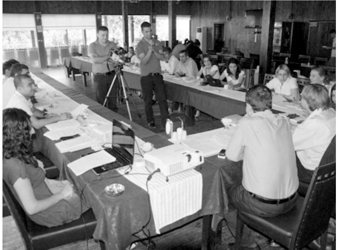
KHRP 'Current Issues in Enforcing Children's Rights' training underway in Şırnak, Turkey.

The sessions kicked-off with presentations on the procedural and substantive issues facing children on trial in Turkey, before focusing on children within the detention system. Throughout the day, group discussions and more focused workshops were used to outline relevant international standards, procedures, practices, and case law related to juvenile justice, as set forth in such instruments as the European Convention on Human Rights and Fundamental Freedoms (ECHR), International Covenant on Civil and Political Rights (ICCPR), International Covenant on Economic, Social and Cultural Rights (ICESCR), and the UN Convention on the Rights of the Child. Both workshops succeeded in improving local lawyers and civil society members' knowledge and awareness of children's rights. In particular, they helped participants to better recognise violations of the rights of children on trial and in detention, and gave them the know-how to identify relevant international human rights mechanisms that can be used to report such abuses and protect against them in future.