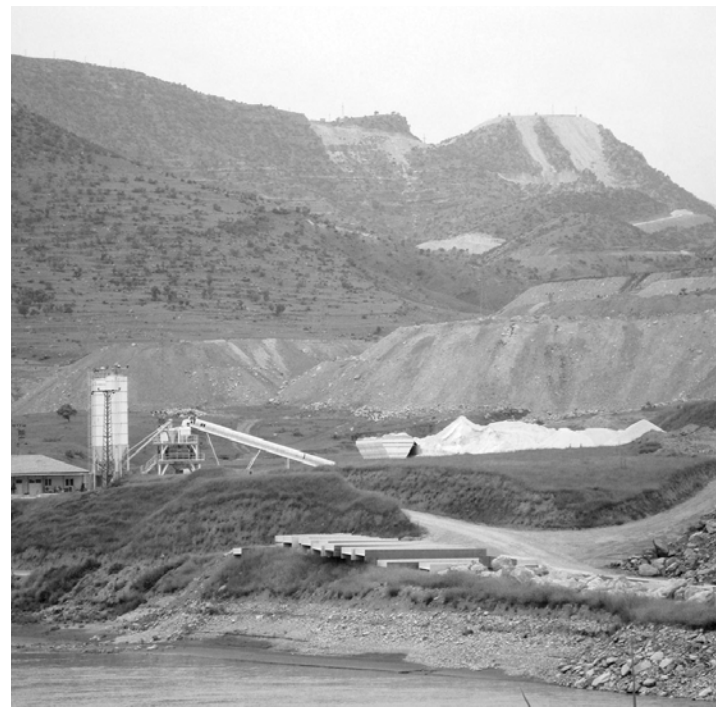
Building-work resumes at Ilisu dam construction site.