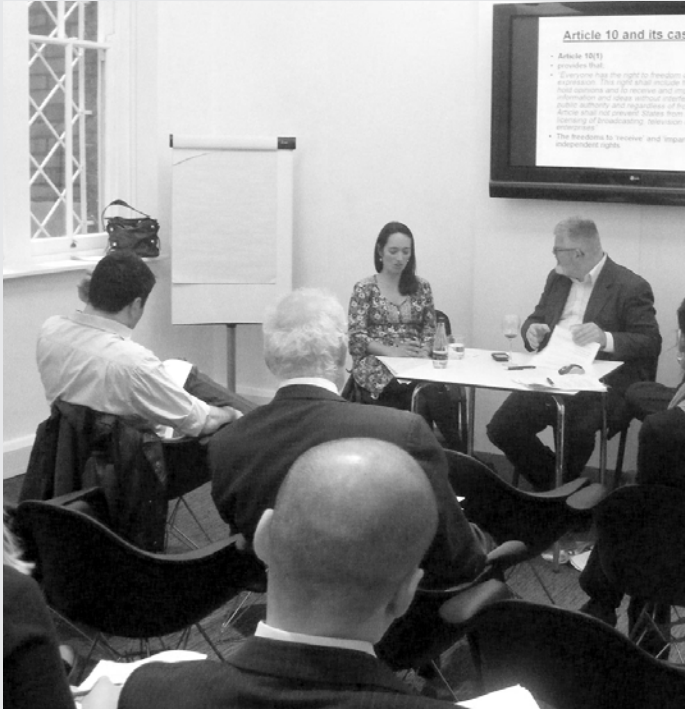
Panel discuss issues of freedom of expression at KHRP Legal Team Meeting, May.