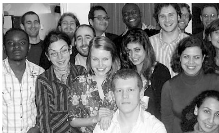
Students from the Applied Centre of Human Rights, York University.

work on Turkish cross-border bombardments in northern Iraq, internally displaced persons, and environmental campaigns. These were used to illustrate how as a small London-based NGO that works closely with an expert and voluntary legal team, KHRP has pioneered groundbreaking litigation strategies before the ECtHR, and effected far-reaching change in the Kurdish regions and internationally.