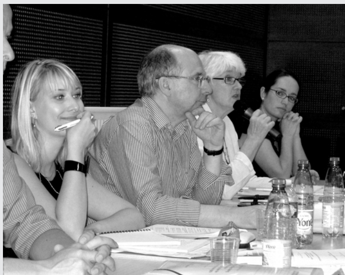
KHRP at Strasbourg workshop on ECtHR.