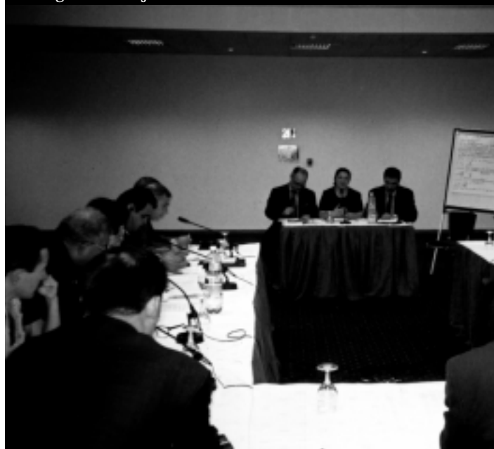
photo: KHRP conducts European Court of Human Rights Litigation Training in Azerbaijan