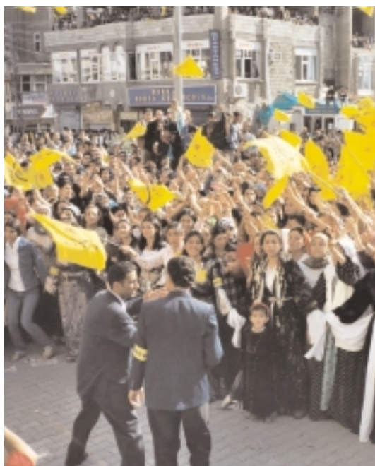
photo: Pre-Election rally held in Hakkari in support of pro-Kurdish party DEHAP. Despite being the leading party in the 13 provinces in the Kurdish region of Turkey, DEHAP did not manage to pass the 10% nationwide threshold required to gain a seat in Parliament.

This disproportionate outcome, which eliminates the choices of nearly half of the country's voters, is the result of an aspect of the electoral system in Turkey which requires candidates to pass a 10% nationwide threshold in order to gain seats. None of the other 16 political parties, continued on page 4