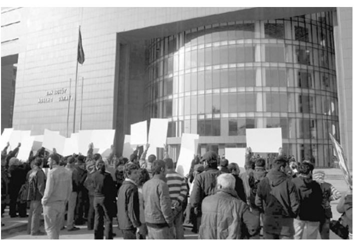
Complainants' supporters outside the court on the day of the hearing