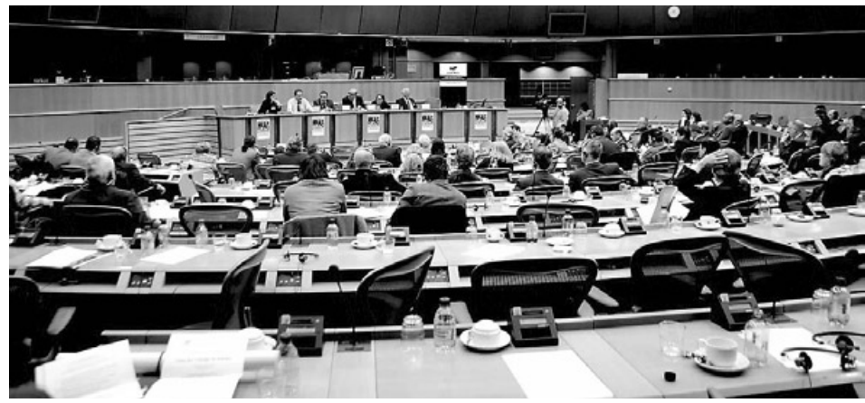
The EUTCC Board of Directors chairs the concluding debate