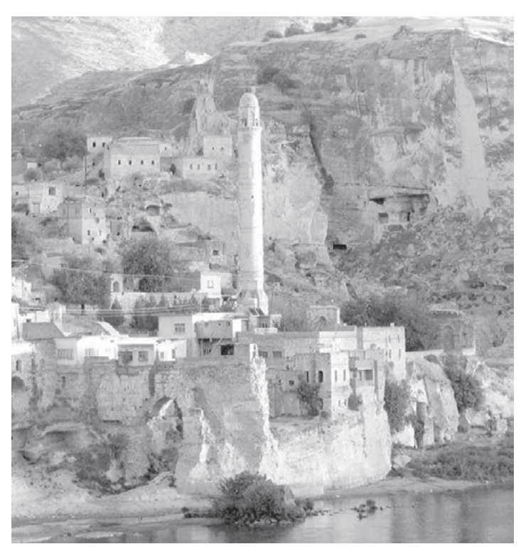
The ancient city of Hasankeyf, which would be submerged by the Ilisu Dam

Earlier in 2008, the Committee of Experts overseeing the Ilisu project had warned that more needed to be done to