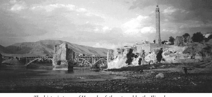
The historic town of Hasankeyf, threatened by the Ilisu dam

In another development, a meeting was held on 20 June between a number of export credit agencies (ECAs) which have pledged funding for the €1.2bn project, the Committee of Experts responsible for evaluating the extent to which the Terms of Reference of the initial finance agreement have been met, and NGOs. The