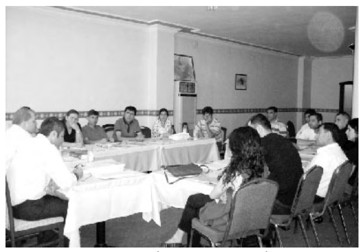
Participants at the training seminar in Şırnak

The training sessions were organised with the cooperation of the Şırnak and Hakkari Bar Associations and followed on from previous KHRP training sessions in these provinces last year. The seminars included information about Turkey's international obligations and procedures for effectively investigating substantive and procedural violations of the