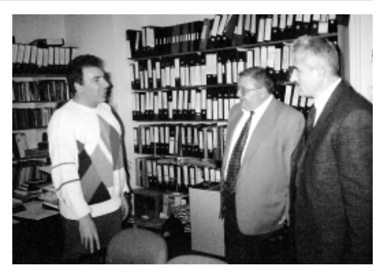
Vice-president of Mazlum-Der (centre) and President of the Law Association in Turkey (right) visit KHRP.

While working at KHRP, I have had the opportunity to meet a person who had to leave his country for fear of his life, due to his belief in the right to freely express his views. To move from paper reports and judgments and meet someone directly affected by Turkey's discriminatory and unjust law is a humbling experience. Hopefully, one day our rights to live freely as an expression of our heritage and individual spirit will not need to be fought for.