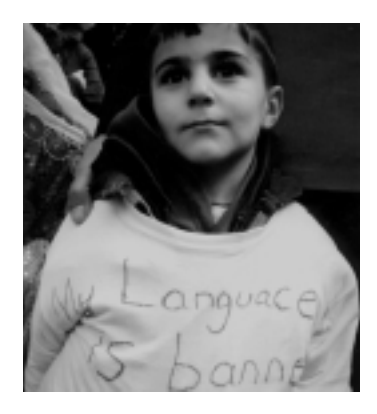
Kurdish child at a London-based rally demanding the right to Kurdish language education in Turkey, 2002. While Turkeyís new reform package includes the right to mother tongue education, serious concerns remain over whether such rights will be fully realised

The most notable changes included the abolishment of the death penalty, henceforth replaced with life imprisonment without the possibility of parole, and the permission for minority groups to broadcast and undertake language education in their native tongue. Further alterations to Turkey's Criminal Code also extended freedom of expression and association, limited the repression of public demonstrations and granted minority organisations the right to own property and real estate. Additionally, legal proceedings for criticising State institutions, including the Army, have been eliminated and imprisonment for press offences converted to fines. For Turkey's large Kurdish minority which has been subject to state repression since the Republic's formation in 1923, such reforms, if implemented properly, may to some extent alleviate an otherwise harsh