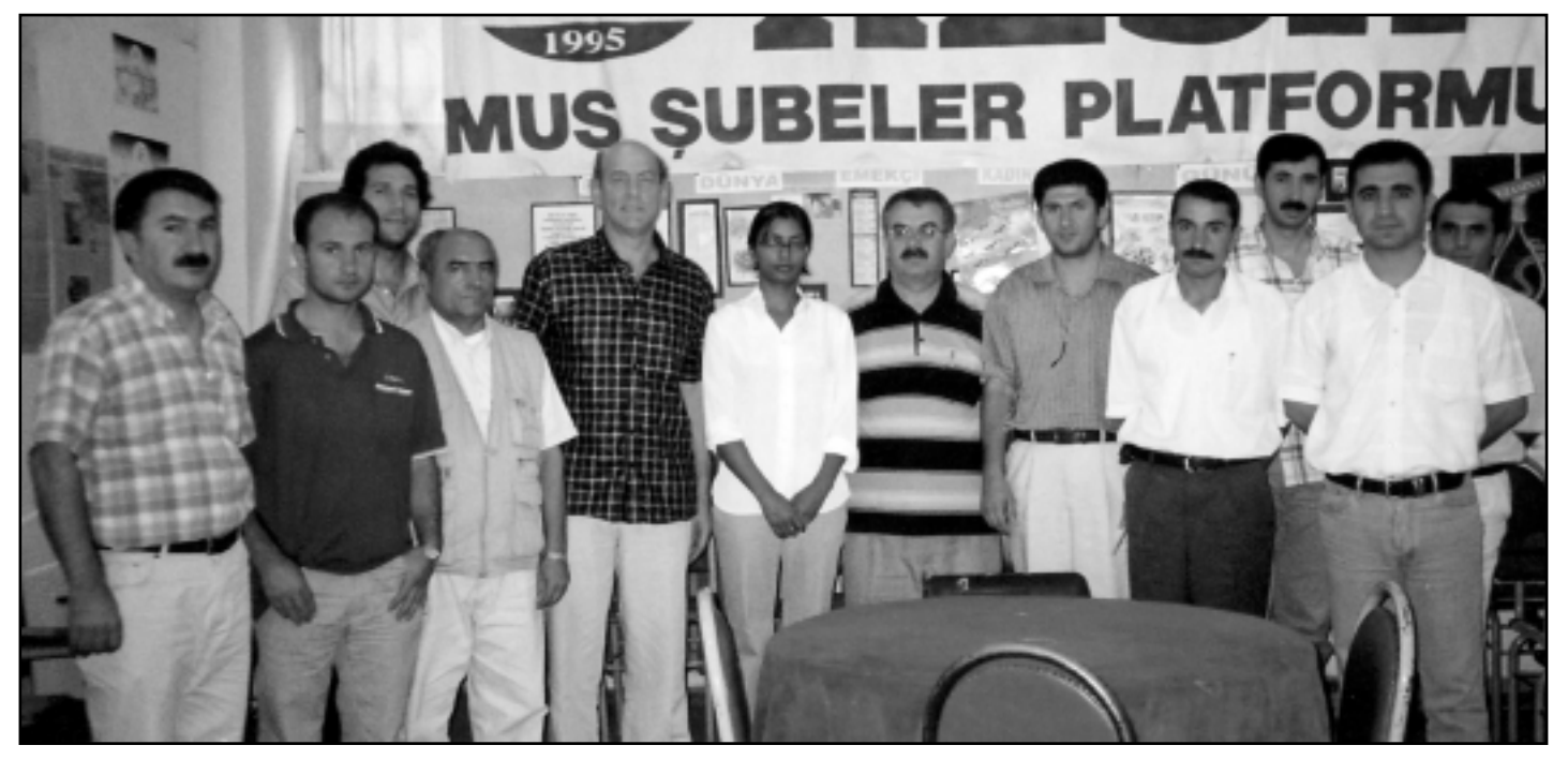
Fact-Finding Mission Delegation with Kesk, the Confederation of Public Servants' Trade Unions in Turkey

Among the issues that require long term attention are restrictions on the use of the Kurdish language; the freedom of political associations to carry out legitimate activities; the freedom of trade unions to protect the economic interests of their members without retaliation or other restrictions or penalties; the conduct of elections; police conduct; freedom of movement; detention,