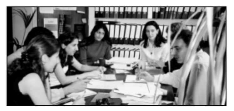
KHRP conducts training session with Azerbaijan interns.