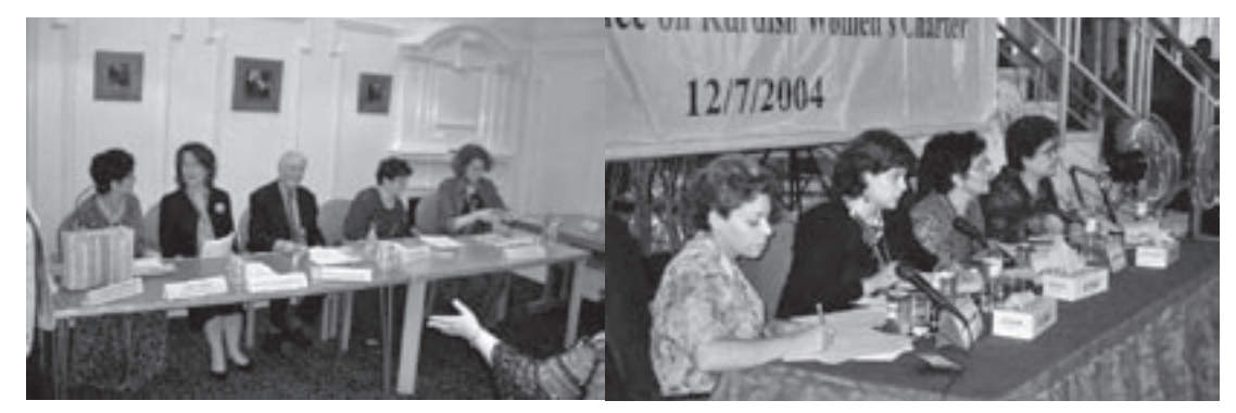
The 'Charter for the Rights of Women in the Kurdish Regions and Diaspora' was launched first at the House of Lords in London (above left) and at the Kurdistan National Assembly in Erbil (above right) in June/ July 2004

The Charter for the Rights and Freedoms of Women in the Kurdish Regions and Diaspora, launched in the House of Lords in June, is being promoted through the Kurdish regions and the diaspora in order to press for the enforcement of Kurdish women's human rights.