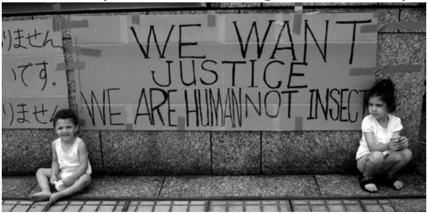
ABOVE: Kurdish children during the protest over the treatment of Kurdish asylum seekers in Japan

Two Kurdish asylum-seeker families staged a sit-in in Tokyo from July to September in protest against Japan's refusal to grant them refugee status. KHRP wrote to UNHCR, requesting that the two families' cases be taken up with the Japanese government.